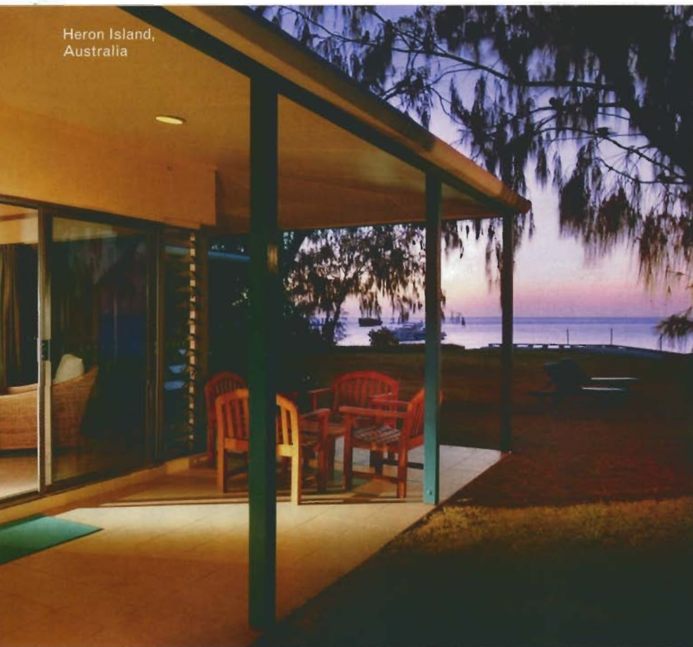
Heron Island, Australia